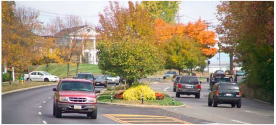
Montgomery Road Downtown

KZF's Transportation Planning Group is committed to innovative solutions for multimodal transportation, land use, traffic, transit and NEPA planning needs. We provide objective analysis to help our clients meet future transportation needs while improving the performance of existing infrastructure and operations. We are committed to meeting our client's goals in making transportation better for future generations.