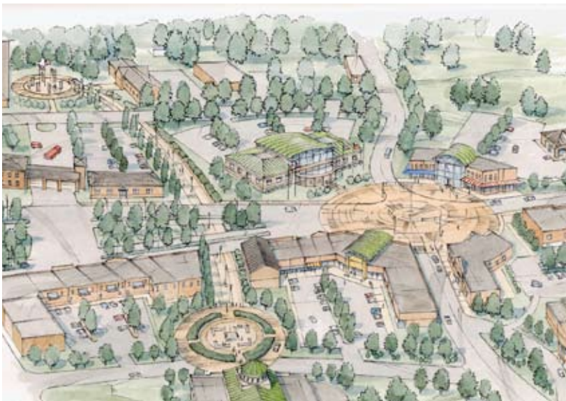
Miami Township Center